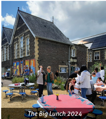
The Big Lunch 2024

"Cake is lovely, the people are friendly, and it is a very welcoming atmosphere."