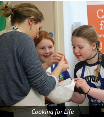
Cooking for Life