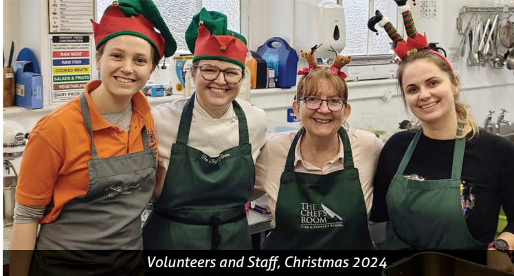
Volunteers and Staff, Christmas 2024

"A valuable and well-done facility that caters to and provides excellent services to the community."